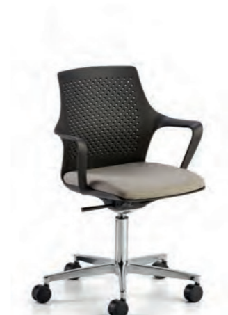
RK11 Sedia girevole base in alluminio e oscillante Swivel chair aluminum base and oscillating