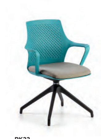
RK22 Sedia girevole base in nylon nera a piramide Swivel chair base in black pyramid nylon