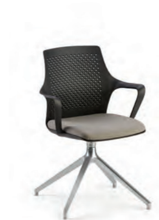
RK12 Sedia girevole base in alluminio a piramide Swivel chair with pyramid aluminum base