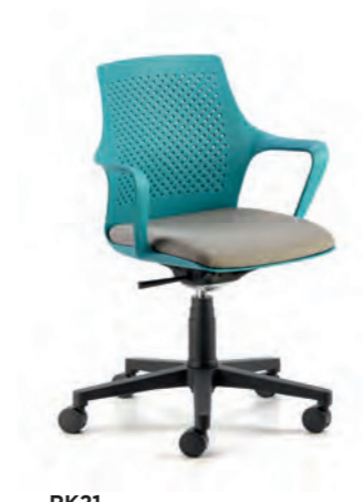
RK21 Sedia girevole base in nylon nera e oscillante Swivel chair base in black and oscillating nylon