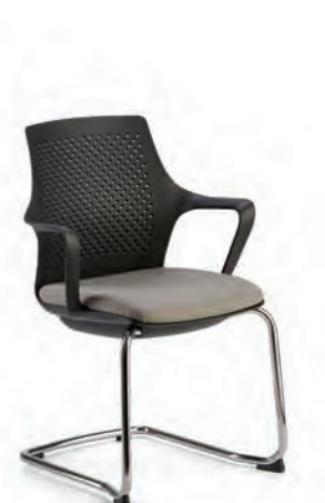
RK13 Sedia fissa telaio a slitta Fixed chair with sled frame