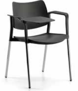
YK13 Sedia fissa con braccioli e tavoletta telaio cromato. Fixed chair with armrests and tablet with chromed frame.