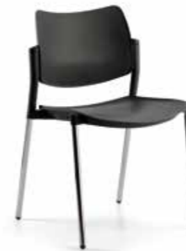
YK10 Sedia fissa telaio cromato. Fixed chromed frame chair.