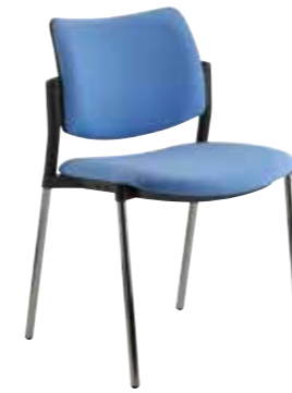
YK20 Sedia fissa telaio cromato. Fixed chromed frame chair.