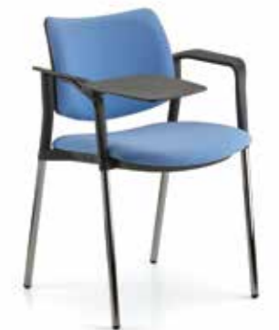
YK23 Sedia fissa con braccioli e tavoletta telaio cromato. Fixed chair with armrests and tablet with chromed frame.