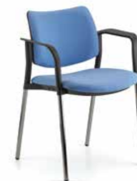
YK21 Sedia fissa con braccioli telaio cromato. Fixed chair with chromed frame armrests.