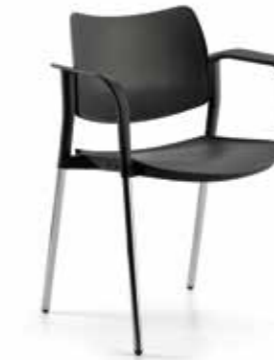
YK11 Sedia fissa con braccioli telaio cromato. Fixed chair with chromed frame armrests.