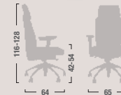
TK 30/TK 31/TK 39 Poltrona ergonomica alta oscillante mov. 19/4/28. High ergonomic armchair w/tilting mov. 19/4/28.