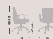
TK 38 Poltrona ergonomica con oscillante mov. 1. High ergonomic armchair w/tilting mov. 1.