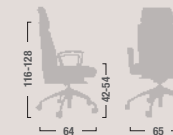
TK 32 Poltrona ergonomica alta oscillante mov. 19. High ergonomic armchair w/tilting mov. 19.